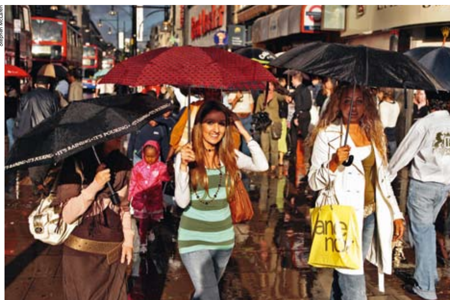
Extreme weather events will bring more unpredictability to our daily lives

Water will present different challenges in different parts of the country in different seasons. In the