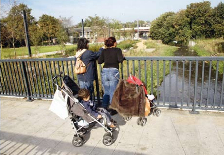
Young parents overlook the wildlife on Lewisham's River Quaggy

system, created 60 hectares of new open space in land surrounding schools, leased 4 hectares to create greenways along inland waterways and provided permanent protection for 40 community gardens.