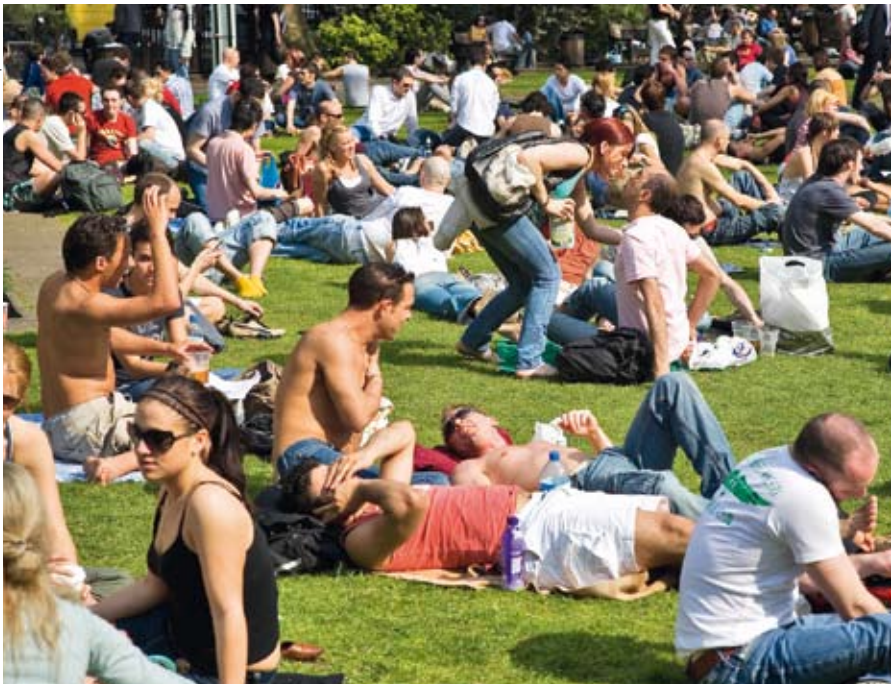
As well as mitigating climate change, green space plays a vital role in making summers more comfortable

Adaptation investment should include mitigation of climate change where possible as well. That way, the future could be less harsh than some predictions suggest.